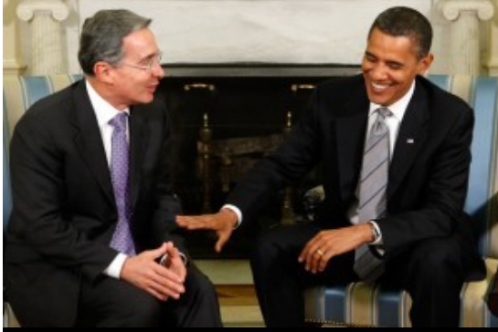
To the outrage of human rights, environmental, trade justice, and labor activists, President Obama met with outgoing Colombian President Alvaro Uribe Velez in June 2010 to discuss the US-Colombia Free Trade

In 2008, President Obama and many Democratic challengers ran with the message that NAFTA, the North American Free Trade Agreement, was a failure. Candidate Obama pledged his opposition to the free trade agreement that the Bush administration had negotiated with Colombia, an agreement that has yet to be voted on by Congress. Unfortunately, since his election, President Obama has changed his tune.. Over the objections of human rights activists, environmentalists, labor unions, AIDS activists, and many Democratic Congressmembers, Obama has pledged to pass the US-Colombia Free Trade Agreement. Meanwhile, Colombian President Santos is continuing his prede Alvaro Uribe's aggressive campaign to build support for the agreement in the US. Six official U.S. Congressional delegations were sent to Colombia during the Uribe administration to experience carefully staged tours highlighting the efforts supposedly undertaken to end the systematic assassination of Colombia labor leaders, and five more are scheduled.