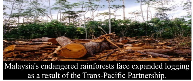
Malaysia's endangered rainforests face expanded logging as a result of the Trans-Pacific Partnership.

A variety of provisions of Trans-Pacific FTA, including “investor-state,” quota prohibitions and more, are likely to encourage the increased export of raw materials throughout the Pacific Rim. That spells more logging, drilling and mining in some of the most biodiverse ecosystems left on Earth. The rainforests of Malaysia and Brunei are already under attack by the palm oil industry, which is converting rainforests into plantations to produce palm oil for food and biofuel use, driving orangutans and other endangered species towards extinction.