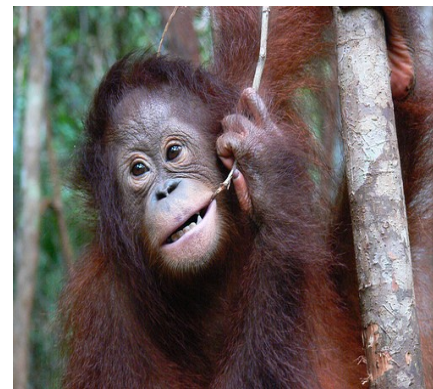
The Trans-Pacific Partnership threatens to increase the destruction of Malaysian rainforests, driving the endangered orangutan towards extinction.

The Trans-Pacific Free Trade Agreement (FTA) is a massive new international trade pact being pushed by the U.S. government at the behest of transnational corporations for completion in 2012. If it continues on its current course, the Trans-Pacific FTA will accelerate “rip-and-ship” resource extraction throughout the Pacific Rim, encourage unhealthy global consumption patterns and significantly limit the steps that communities can take to address climate change and other pressing environmental concerns.