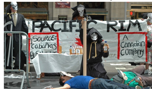
When Pacific Rim Mining Company sued El Salvador under the Central America Free Trade Agreement for preventing a mining project that risked contaminating the nation's drinking water with arsenic and cyanide, protesters held a satirical product launch for Pacific Rim Mineral Water – bottled water containing arsenic and cyanide.

If like past agreements, the Trans-Pacific FTA’s sanitary and phytosanitary chapter will also require that countries can only enact “scientifically justifiable” food safety regulations. While crafted in the name of increased trade, the clear effect of such a provision is to make it harder for countries to restrict the use of pesticides, food additives or genetically-modified organisms based on the precautionary principle. Beyond just food safety regulations, however, a leaked draft of the U.S. proposal for a so-called “regulatory coherence” chapter would also impose a